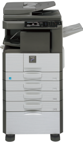
MX-M316N model shown.

NETWORK READY A3 BLACK & WHITE MFP WITH FLEXIBLE DESIGN