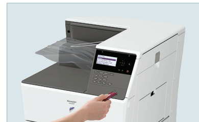
Front USB port for easy direct printing of PDF files from memory devices