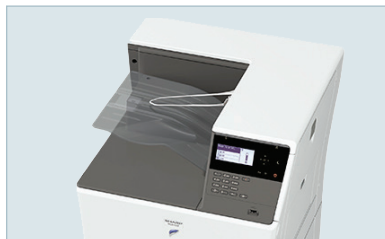
Compact Design easily fits into small office spaces